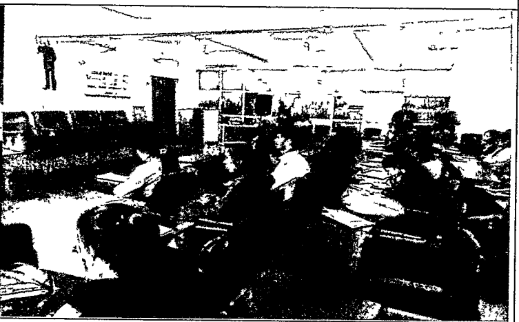
Poem Singing Competition