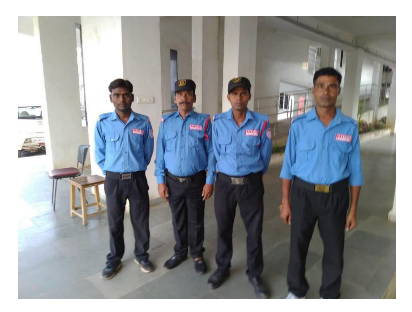
Security guards: male and female