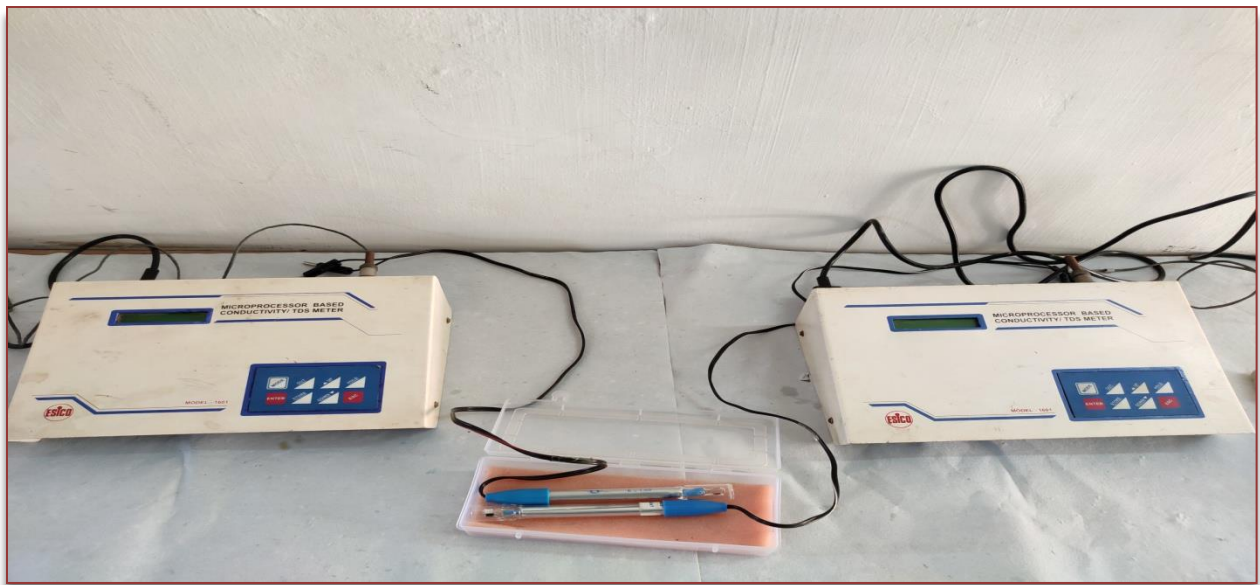
Microprocessor Based Conductivity/TDS Meter