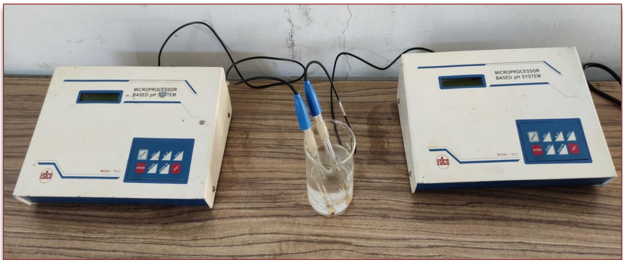
Microprocessor Based pH Meter