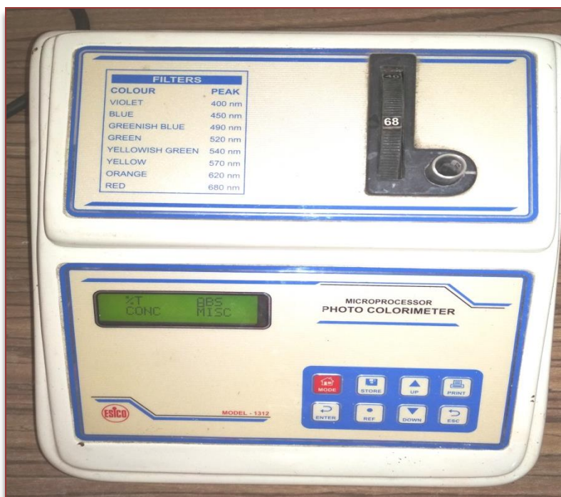
Microprocessor Based Photo Colorimeter