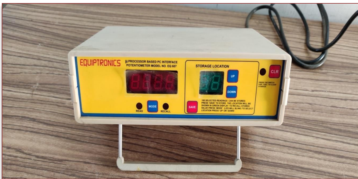
Microprocessor Based Potentiometer